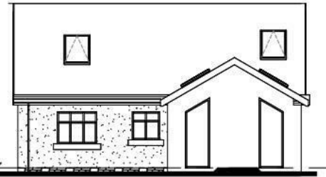
Proposed Rear Elevation 1 : 100