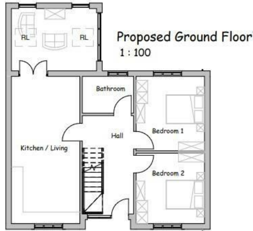
Proposed Ground Floor 1 : 100