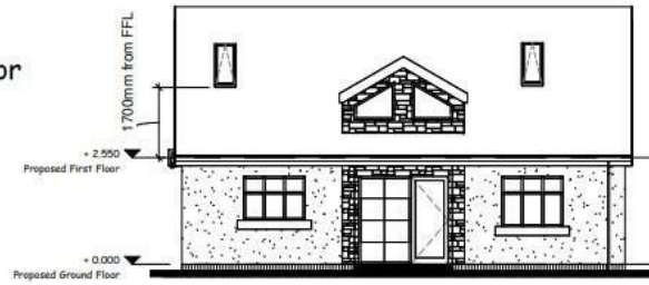
Proposed Front Elevation 1 : 100